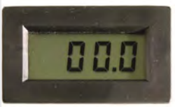
- Digital luxmeter