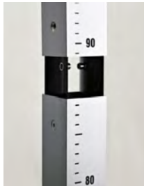
Column in two sections