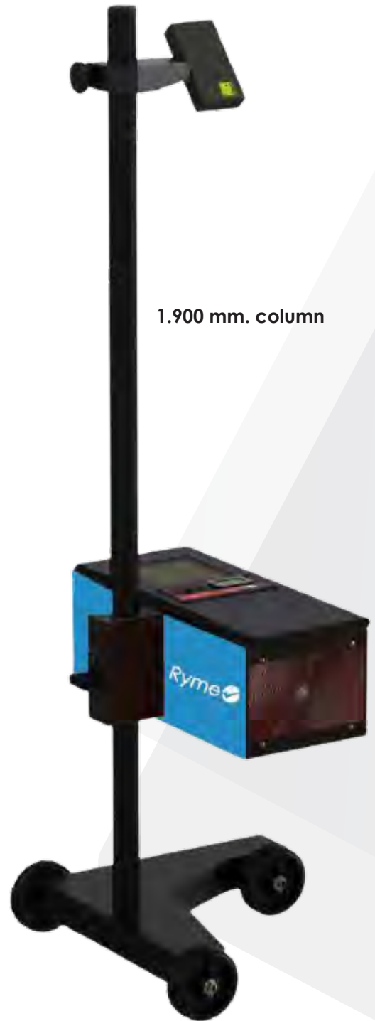
1.900 mm. column

Debido a la continua evolución de nuestros productos, las características técnicas y de diseño podrían estar sujetas a modificaciones, sin previo aviso.